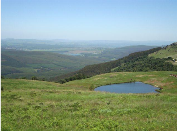
Enjoying the view at Lookout Rock