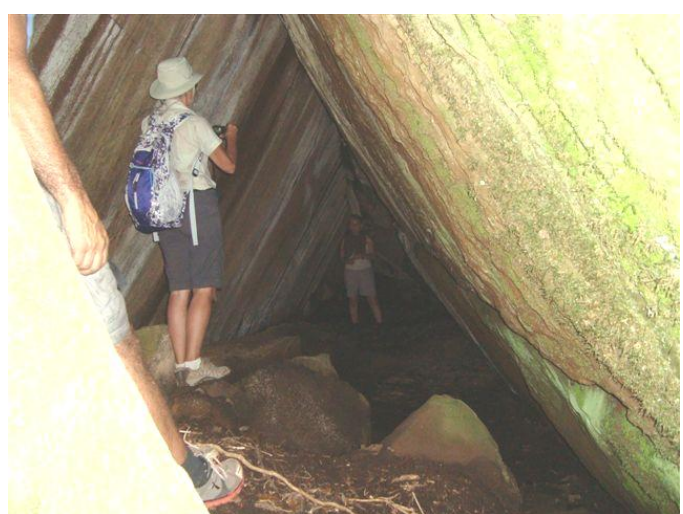
Cave with an "A frame" roof