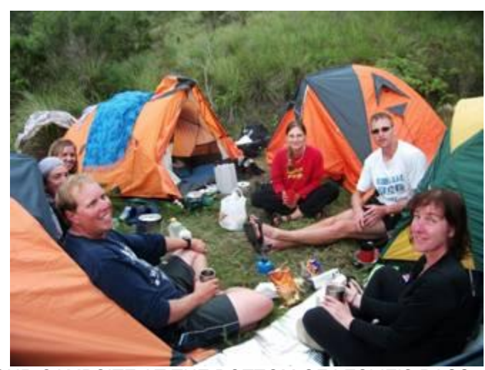
OUR CAMPSITE AT THE BOTTOM OF LESLIE'S PASS