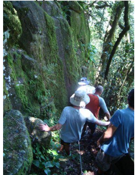
Heading down to the caves